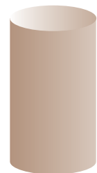
Billet or Cake Casting